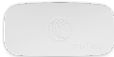
Mid-Gain 17 dBi