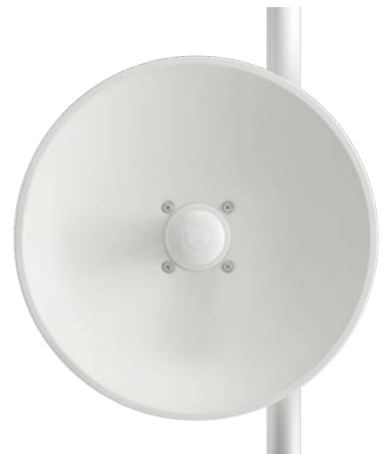
High-Gain 24 dBi